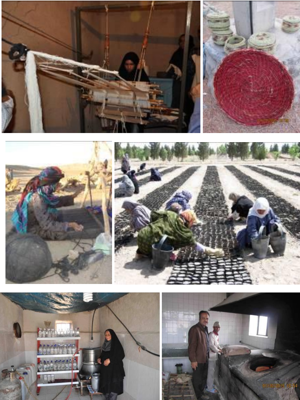
Figures 20-33: Various empowering activities of rural women cooperatives in Birjand, centre of South Khorasan province (2010-2015)

With respect to findings of the research we can summarize them as following issues: