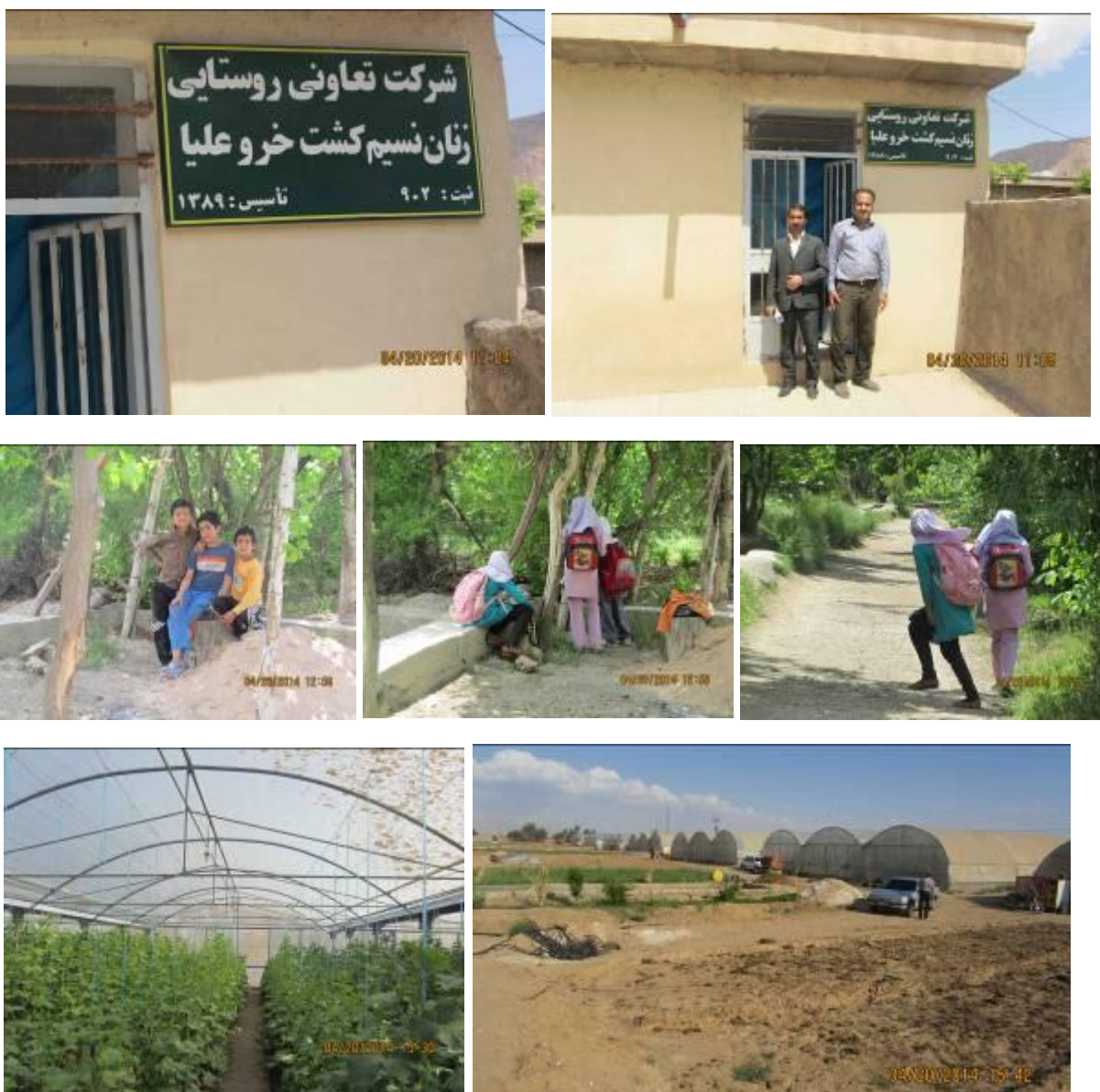
Figures 1- 7: Rural women cooperative of Kharve Olia village on Tabas city, 335 km distance from Birjand, centre of South Khorasan province, and its greenhouse (from outside and inside) plus girls and boys that came back from their primary school that established in recent years (May 20, 2014).