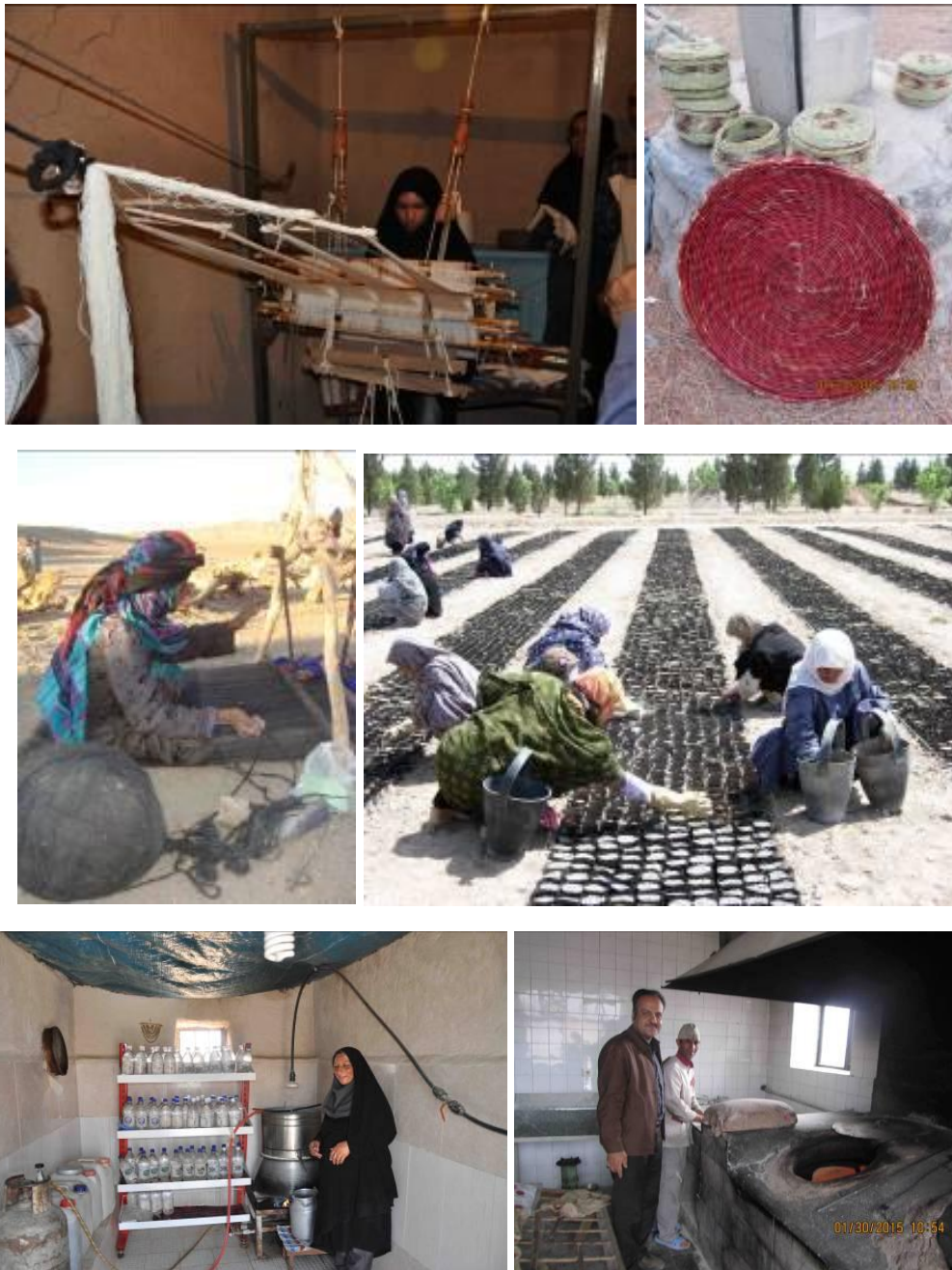
Figures 20-33: Various empowering activities of rural women cooperatives in Birjand, centre of South Khorasan province (2010-2015)

With respect to findings of the research we can summarize them as following issues: