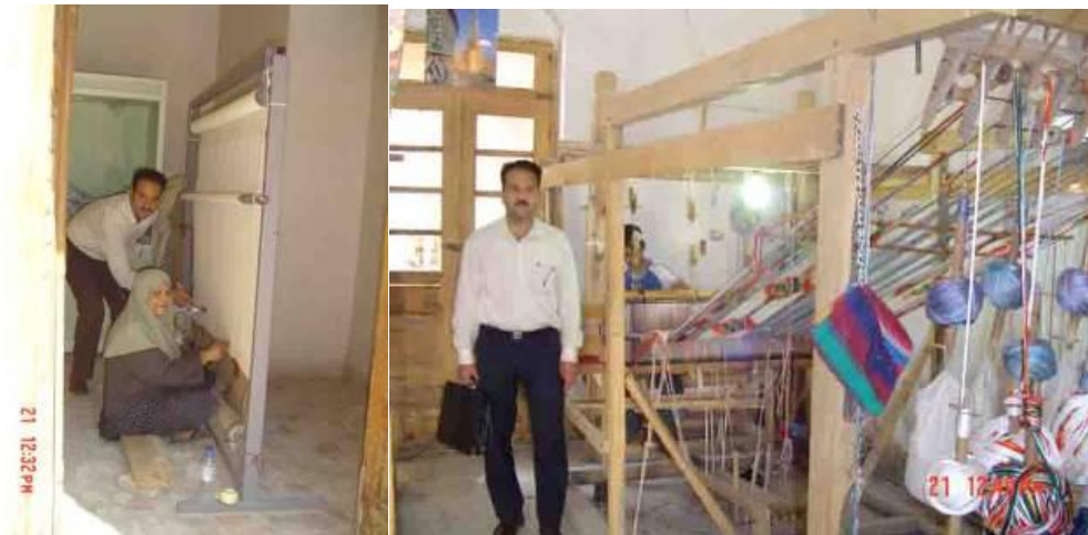
Figure 16 -17: A handicrafts cooperative in Yazd province in center of Iran (2008)

In figures (2 & 3), researcher presented a handicrafts cooperative in Yazd province in center of Iran.