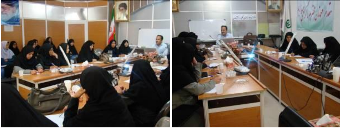
Figures 18 & 19: Entrepreneurship lecture for managers of rural women cooperatives in South Khorasan province (2010)