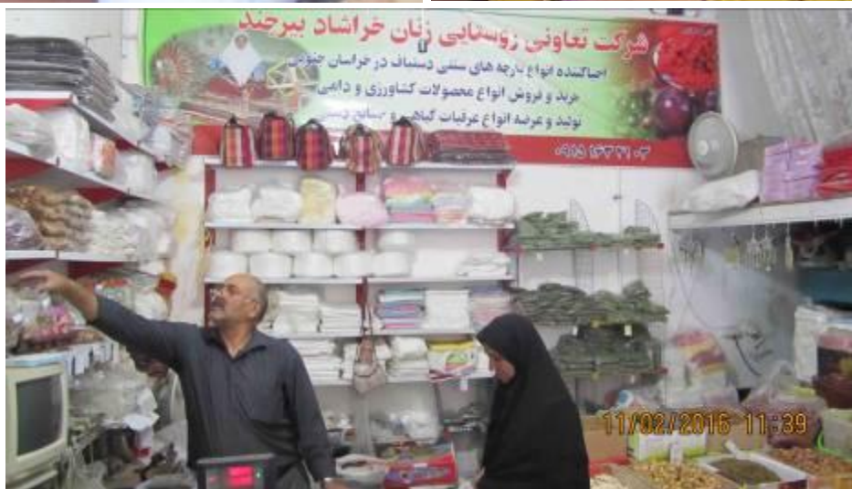
Figures 8-14: A department store of rural women cooperative of Khorashad village (Distance from Birjand: 30 km) in Birjand, centre of South Khorasan province (November 2, 2016)